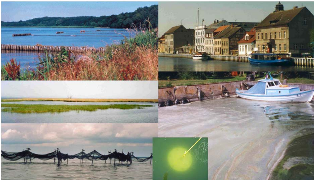
Figure 2: The quiet and serene Odra Lagoon, despite its scenic appeal, suffers from severe eutrophication.

The landscape surrounding the Szczecin/Oder Lagoon is flat, dominated by agricultural land and forests. In some areas sand, gravel, oil and gas are exploited. Broad belts of reeds and artificial sandy beaches near the few small towns characterize the coastline. Owing to its outstanding ecological value and scenic beauty, most of the coastal area has become a nature protected zone. A detailed description of the lagoon's ecology is given in Radziejewska & Schernewski (in press).