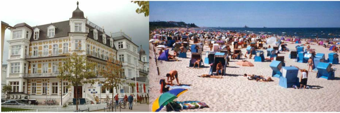
Figure 3: The Baltic Sea coast (Ahlbeck, Usedom). The photograph on the left shows a prime example of traditional architecture. The photograph on the right shows flourishing tourism on the beach.